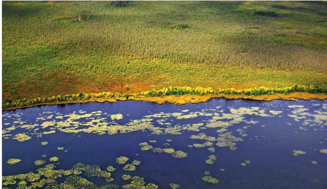
Climate and Hydrology